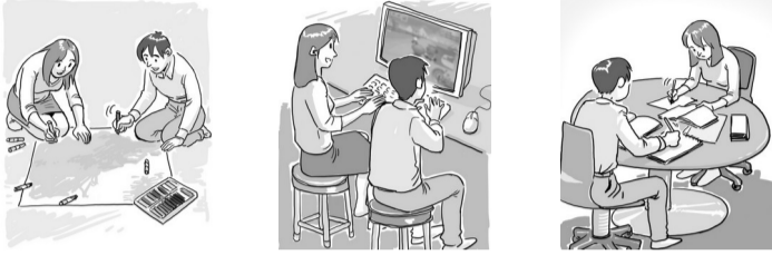
(A) (B) (C)

12. 대화를 듣고, 두 사람이 하려는 일을 순서대로 나열한 것을 고르시오.